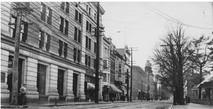
Liberty Street, looking north from 2nd Avenue, 1905