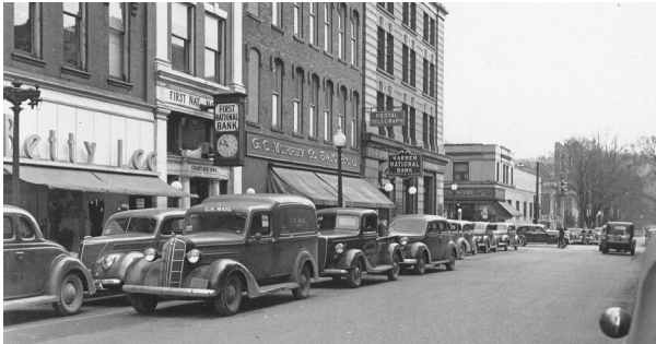
300 block of 2nd Avenue, 1940s

8. This section of town has historically been the center for local banks. One of them was Warren _____ Bank. On opening day, a total over $40,000 was deposited, an astonishing amount in 1893. It would grow to be among the top 5% largest banks in the US in the 1960s. (330 2nd Ave.)