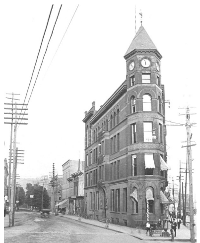
2nd & Pennsylvania Avenues