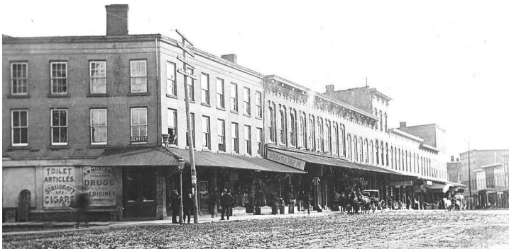
300 block of Pennsylvania Avenue West

18. The name _____ is synonymous with a long-standing dry cleaner, but it also goes way back in Warren’s past with as a dry-goods store. (219 PA Ave., W.)